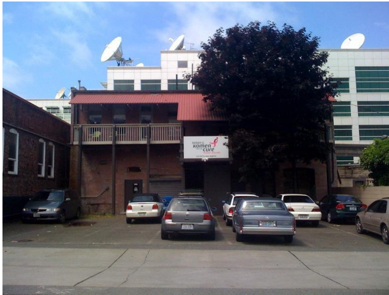
Komen Puget Sound- view from the alley entrance

Below is the view of the Komen entrance: